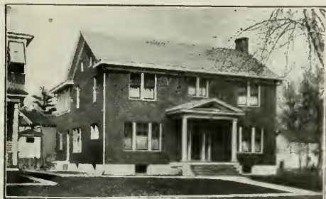
FAIRFIELD, IOWA (Manse)